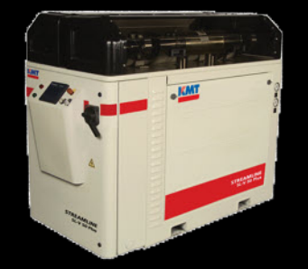
SL-V 50hp 60,000 psi

*Other pumps available are 30hp @ 60,000 psi and 125hp @ 90.000 psi.