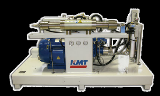
S-50hp 60,000 psi