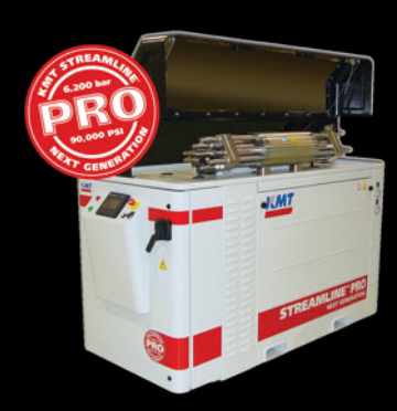
Streamline 60hp 90,000 psi