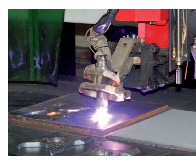
Bevel cutting with 3D-LINK