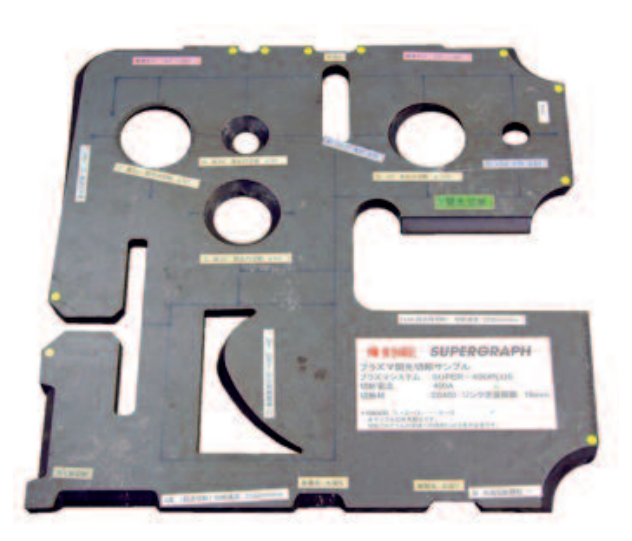
Cutting example - Versagraph with 3D-LINK

Due to arc voltage height control, precise setting of the torch over the entire cutting process is achieved. This ensures cutting precision over the entire cutting length. The torch collision protection and the tactile torch height adjustment device reduce maintenance requirements and adjustment work to a minimum.